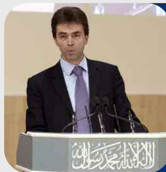
Tom Brake MP for Carshalton and Wallington. Has also served as Shadow Spokesperson for Transport, International Development and the Home Office

I think we need to remember that peace is something that can be found often in places that are where you least expect to find it. I organised a few years ago a peace symposium not on this scale of course but involving Palestinian Parliamentarians and Israeli Parliamentarians. I think that the lesson I learnt from that was, having initially panicked about whether they were going to be physically able to sit in the same room together, that in fact very often when you