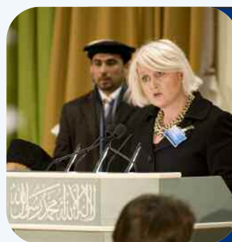
Siobhain McDonagh MP of Mitcham and Morden since 1997. Prior to this, she was the youngest councillor in London when she was elected to Merton Council in Colliers Wood ward in 1982.

I've often observed with my political colleagues and friends that, no matter what part of the world we're from, we're all essentially the same. Sure, we have different cultures, different languages, and different customs, but I feel we all seek the same things – happiness and well-being – and we all try to avoid suffering and harm. Many of us share important values such as: equality of opportunity; social