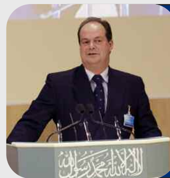
Stephen Hammond MP for Wimbledon since 2005. Has also served as Shadow Minister for Transport. Mr Hammond is also a regular attendee of the Community's events including the Annual Convention

We have before us this evening 'Love for all, Hatred for none', and in many Christian churches tomorrow morning the words will go out 'Peace and Goodwill to all Men'. But, ladies and gentlemen, it is also true that so many wars have actually been fought in the name of religion. Therefore, if we want to look for one source of peace, it must be that men of religion stand up for the true nature of their religion and cast out those who seek to corrupt it. For those of us in politics, we have an obligation upon us. For if we are also to help the cause of peace, we must drive out the sources of injustice, and hope and work to ensure that communities can live and pray together.