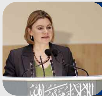
Justine Greening MP for Putney, Roehampton and Southfields. Also served as Shadow Minister for the Treasury and Shadow Minister for Communities and Local Government

I think breaking down those barriers is absolutely vital, and I think it does have to happen not just at the national level but also at the local level. I really pay tribute to the work that the community does, and also internationally with its wonderful charity Humanity First. I was honoured to be able to support one of the fund-raising events that was held for Humanity First only a couple of weeks ago. For those of you who aren't