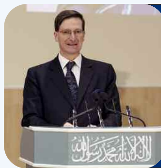
Dominic Grieve QC MP for Beaconsfield and has held a number of senior positions in the Shadow Cabinet including Shadow Home Secretary and Shadow Justice Secretary

If I may disagree very gently with Tom Brake this evening, I'm sure that the coming weeks of the general election may actually be in some ways rather unedifying. Actually, they are the tolerance in action because of our ability to engage in discourse - often of a rather painful kind – and yet still