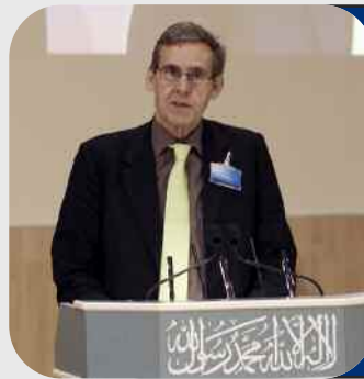
Martin Linton MP for Battersea, Balham and Wandsworth. Currently the Secretary of the all-party Arab League group.

The Islamic country I have visited most is Palestine, as chair of an organisation called the Labour Friends of Palestine in the Middle East. I have visited Gaza and the West Bank three times in the last couple of years. I find that Palestine is a wonderful example of a tolerant community. Muslims and Christians live very happily side by side. Of course there are Jewish Palestinians too who live in harmony in that community. It is only when Israel seeks to take land from Palestinians that there is conflict. I hope finally now you will have seen in the news over the last few days there is a possibility again of peace talks. I very much hope that chance will be seized and we will finally have an independent Palestine alongside a safe and secure Israel.