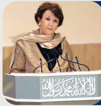
Laura Moffat MP for Crawley since 1997 and the first nurse to be elected to Parliament. Also served as Parliamentary Private Secretary in a range of departments including Health, Education & Pensions.