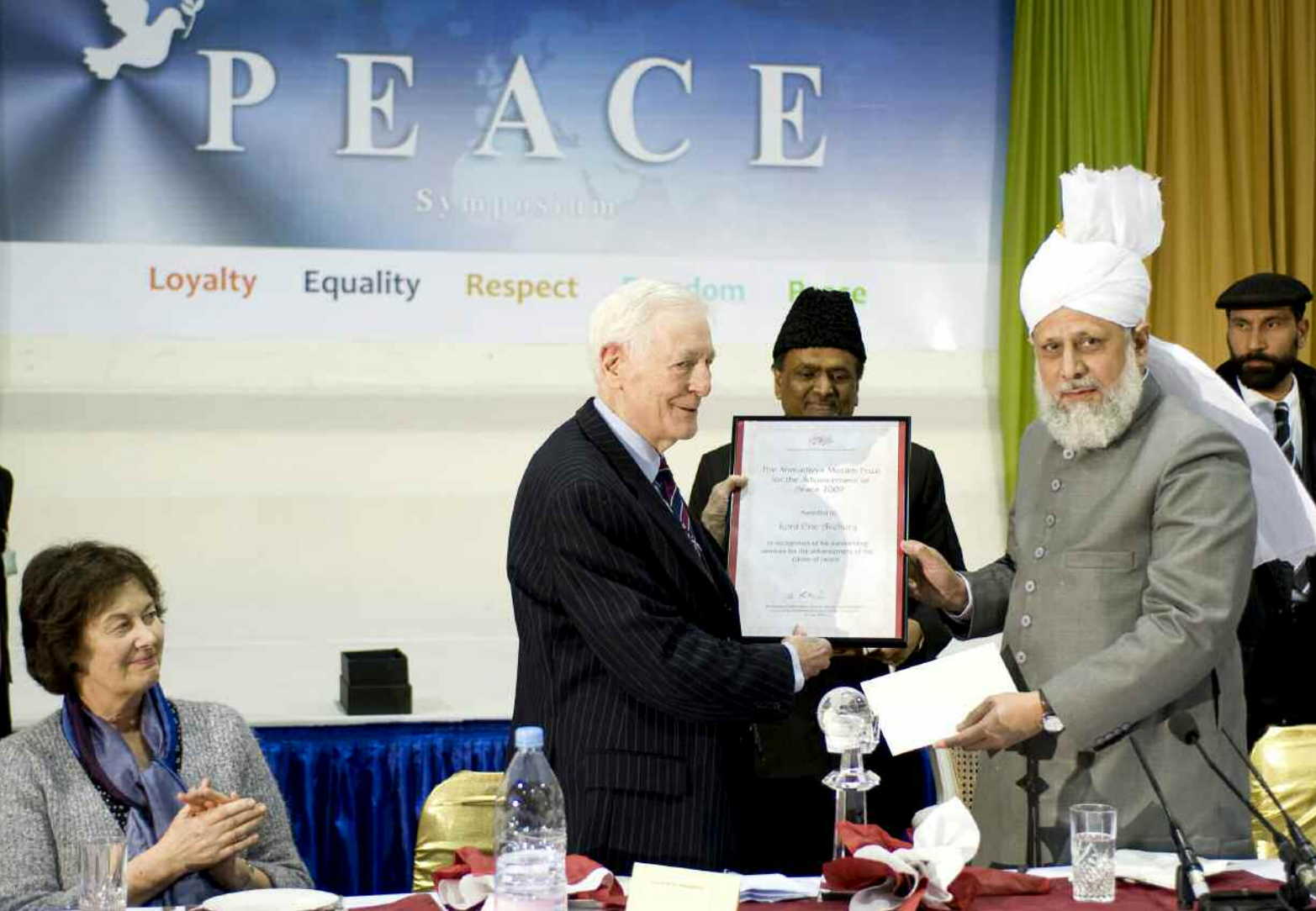
Award and Certificate presented by Hadhrat Khalifatul Masih V to Lord Eric Avebury