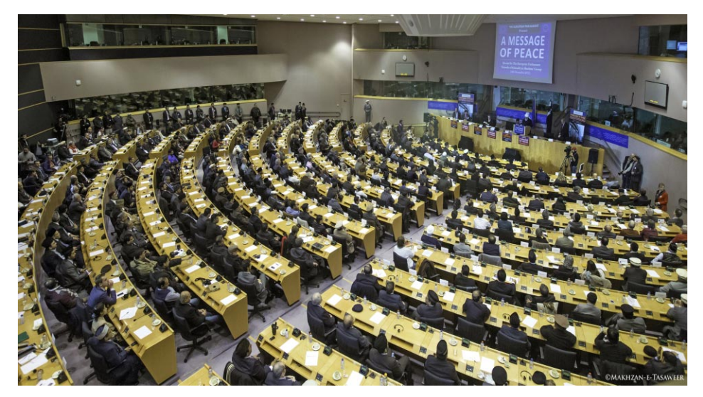
"... a fundamental and basic teaching of Islam is that a true Muslim is a person from whose tongue and hand all other peaceful people are safe. This is the definition of a Muslim given by the Holy Prophet Muhammad (peace and blessings of Allah be upon him)."

(European Parliament, Brussels, 4 December 2012)