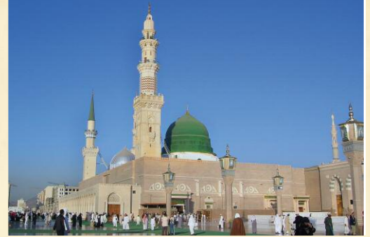
Al-Masjid al-Nabvi 'The Prophet's Mosque' (pictured on the cover and above) is situated in the city of Madinah. Its compound also houses the final resting place of the Holy Prophet (peace and blessings of Allah be upon him). The mosque is considered the second holiest site in Islam and is one of the largest mosques in the world.

The Holy Prophet (pbuh) passed away in 622 CE leaving behind a very pious and righteous community of believers who continued his mission to spread Islam in all parts of the world despite heavy odds. Today there are more than one billion Muslims in the world.